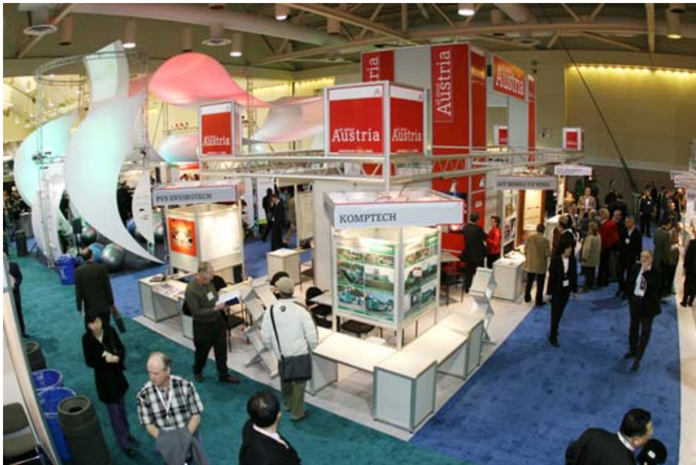
Austria Pavilion at GLOBE 2006