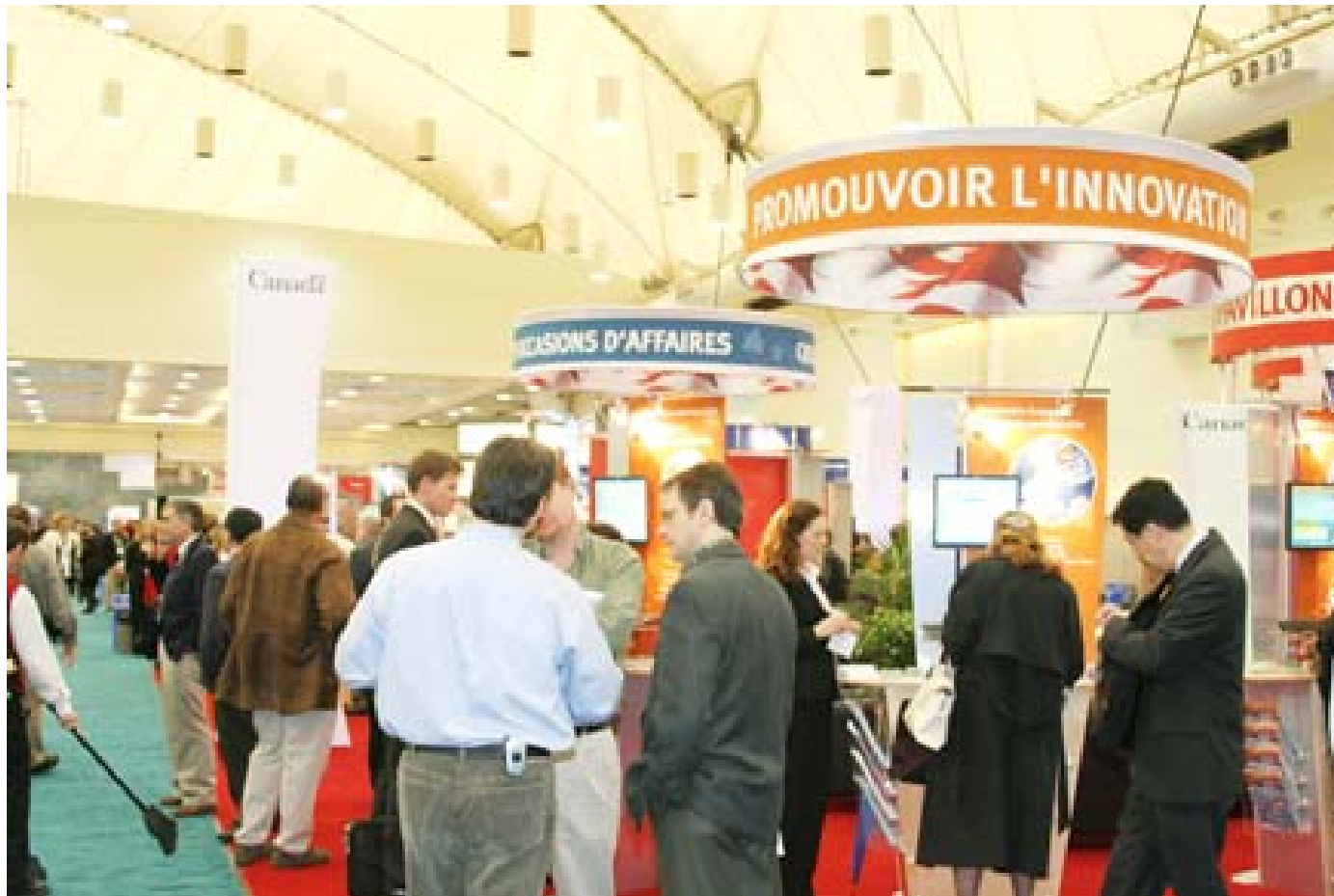
Canada Pavilion at GLOBE 2006