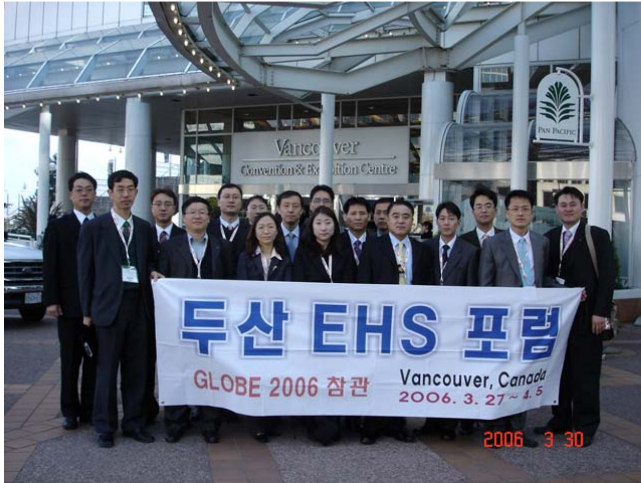
Korean Delegation at GLOBE 2006